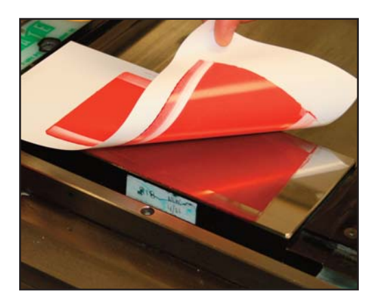
STEP 3: The printed sample is then heated in the "Heat Set Tester". The paper is placed on the machine and is passed through an oven where quartz lights super-heat the sample on both sides.

STEP 2: The paper sample is cut for testing and immediately printed on both sides, to simulate typical coverage on press. Here we use a special red ink, at a film thickness of 0.05 mil on both sides.